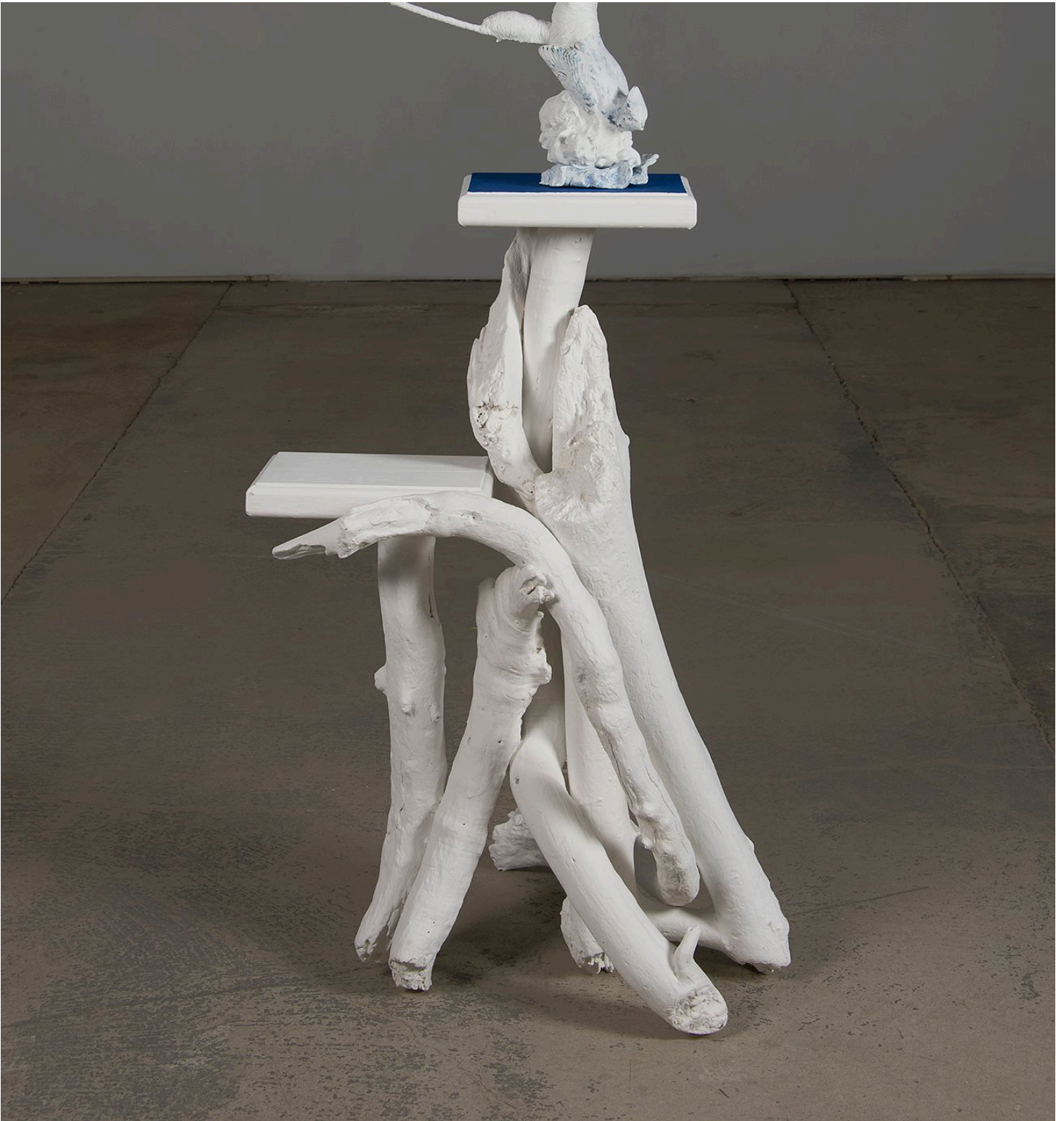
(8286)-Still Life #20, 2016, Mixed Media; (8292)-Still Life #21, 2016, Mixed Media; (8302)-Still Life #19, 2016, Mixed Media.